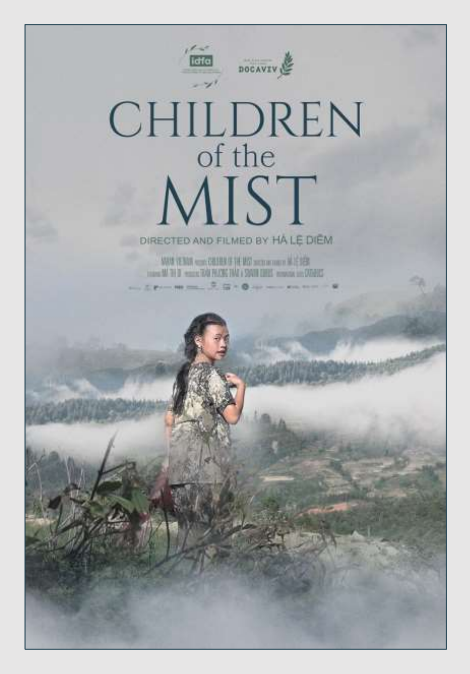
Winner - Best International Film - DocAviv Film Festival Winner - Best Directing - IDFA (International Documentary Film Festival Amsterdam)

2021 | Vietnam | Hmong, Vietnamese with English subtitles | 90 minutes | 1.78:1 | 2.0 Stereo